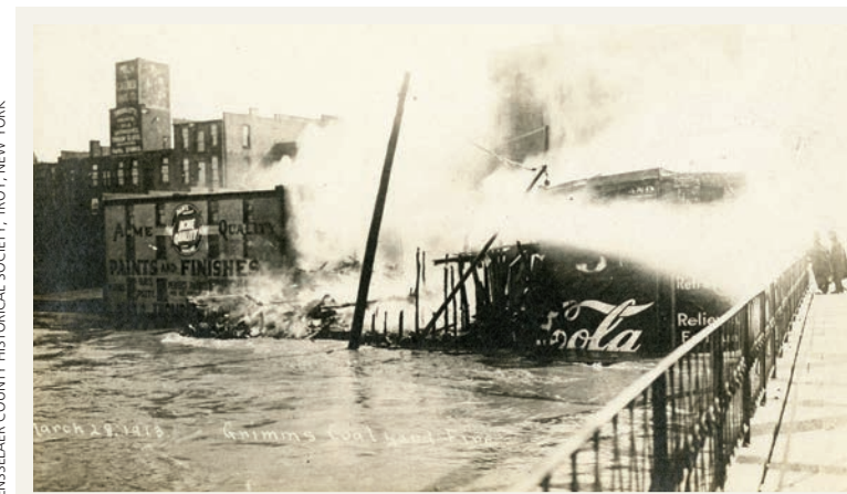
RENSSELAER COUNTY HISTORICAL SOCIETY, TROY, NEW YORK

Knowing that rural areas upriver still relied on outhouses rather than indoor toilets, and that flooding and runoff would have swept human waste into the Hudson, Albany Commis-