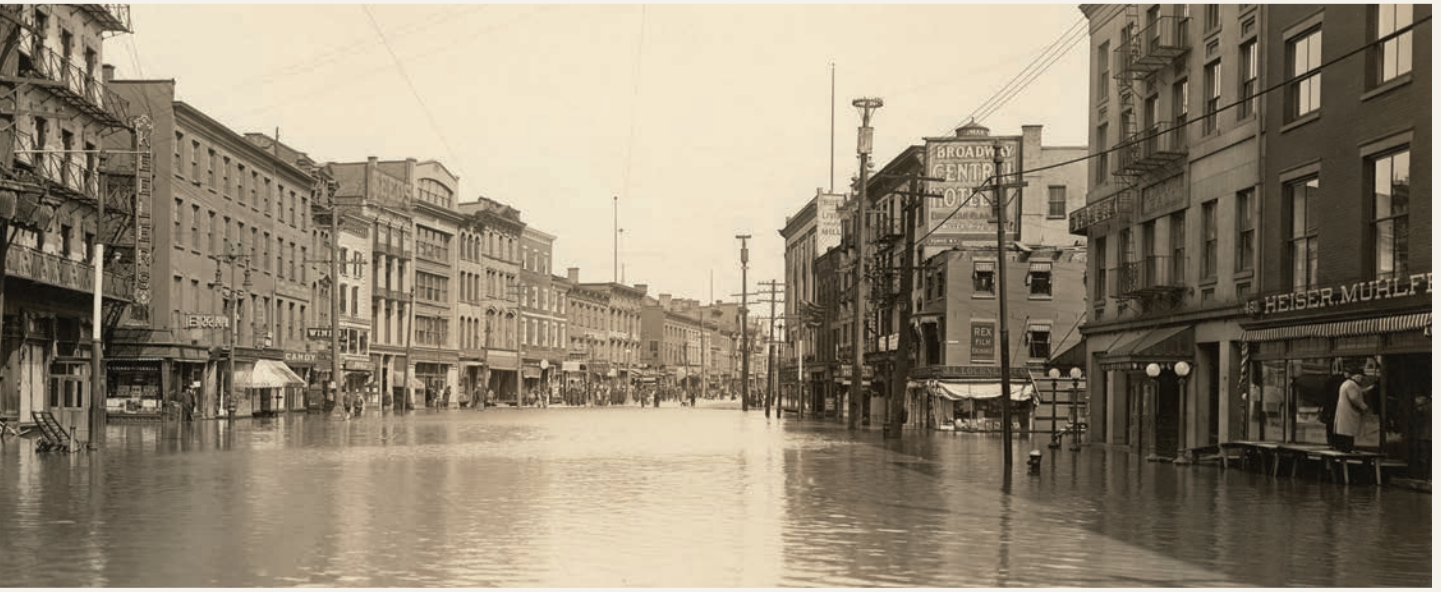
ALBANY INSTITUTE OF HISTORY &amp; ART LIBRARY