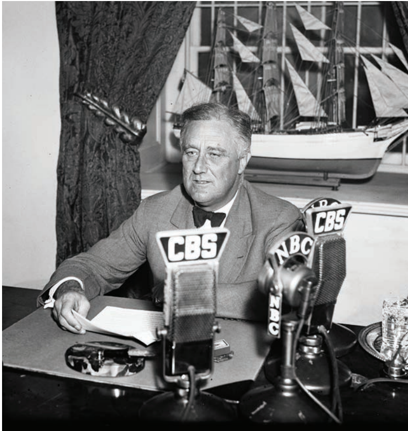
FDR's greatest media innovation was his extraordinary dominance of radio.

but seemingly extemporaneous, broadcasts that many listeners later convinced themselves that the president had been on air almost continuously.