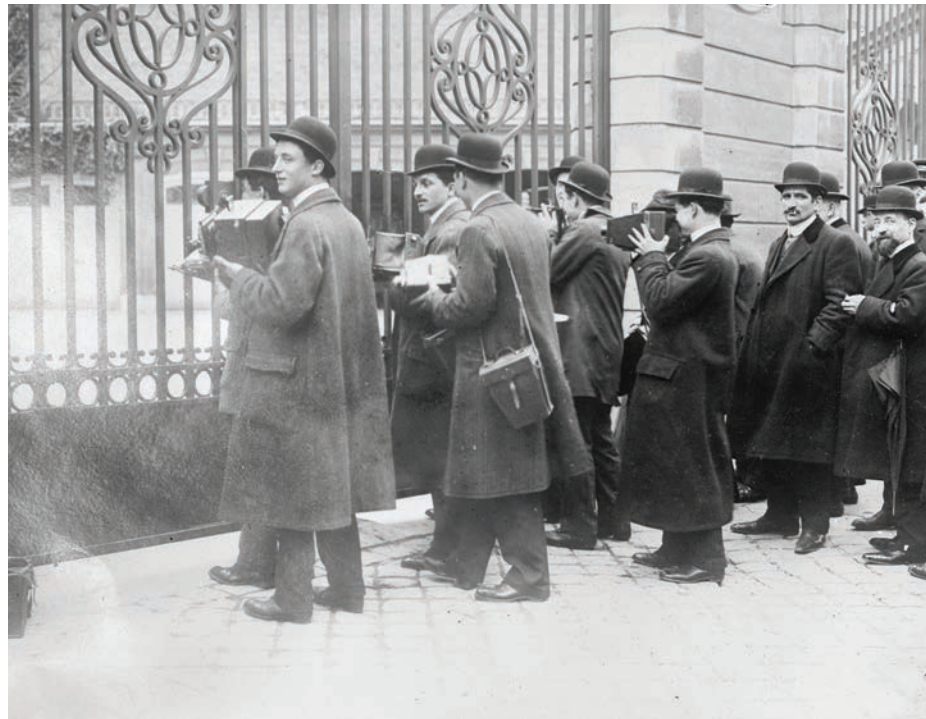
Reporters who violated TR’s rules were ostracized.

Access had its limits. TR also imposed stringent ground rules on the press. He punished reporters who