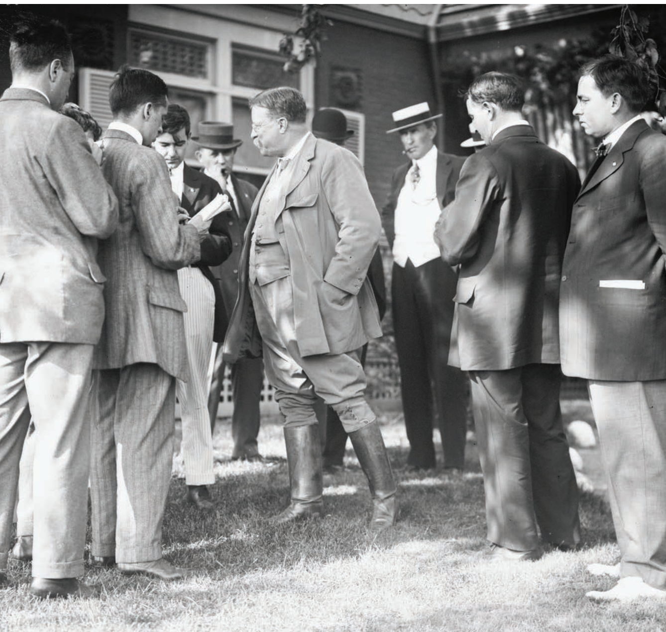
Friendly reporters secured a place in TR's "Paradise."