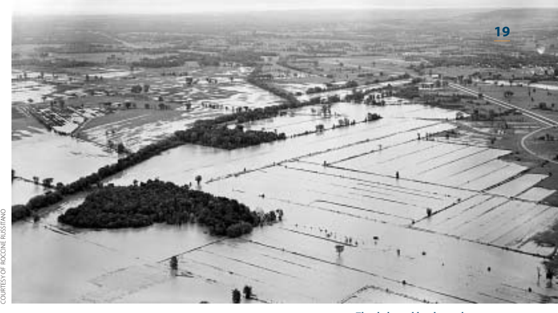
Flooded mucklands north of Canastota.

They bought "virgin territory," about ten to fifteen acres of woods that they cleared by hand. Many used equipment harnessed to horses to pull up roots and weeds. Carlo Tornatore's farm was cleared faster: the men marked the trees to be