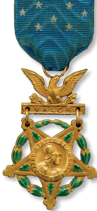
The Medal of Honor, as it looked in 1918

There is no higher military decoration than the Medal of Honor. It is the shining star at the very top of the military's so-called Pyramid of Honor and it is only awarded for documented acts of conspicuous bravery and intrepidity above and beyond the call of duty. Often the acts are fatal, and in such cases the medal can be viewed as a posthumous memorial. But it can get complicated for recipients who live to tell the tale because the medal carries huge symbolic responsibility. Those who wear it are weighted with the expectation to publicly personify the qualities it represents. Recipients are expected to be the best face of the military, and most are able to embrace that responsibility by making frequent appearances to tell their stories, and to be celebrated as heroes. Over and over. Whittlesey put on a game face for three years, but it seems he finally could no longer do so. The cultivation of such a public persona was completely at odds with Whittlesey's natural reticence. In fact, I believe the medal became a millstone that only grew heavier with the passage of time.