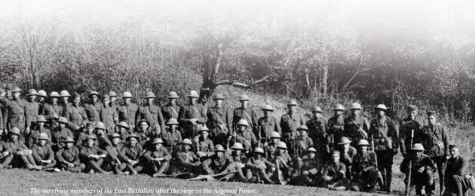
The surviving members of the Lost Battalion after the siege in the Argonne Forest.

Reflecting on Whittlesey’s presumed suicide I find myself as interested in the ‘how’ as in the ‘why.’ Years ago I read that the poet Hart Crane ended his life by jumping off an ocean liner at sea. It made me shudder back then, and I feel it even now as I write about Charles Whittlesey. Such a terribly lonely way to die it seems to me, perhaps with final moments of panic or regret as the ship obliviously plows on, lamps, laughter, and life receding in the distance. A chilly way to die as well. So, it was the method that really caught my attention. Why book passage to Cuba? Why Cuba? Did it matter at all where he booked passage? How did he pack for the voyage? Did he purchase a new tropical suit and straw boater that he knew he would never wear? It is clear that this was not an impulsive act of despair because Whittlesey left letters both in his