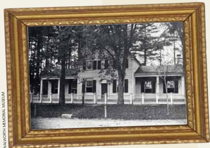
WALWORTH MEMORIAL MUSEUM