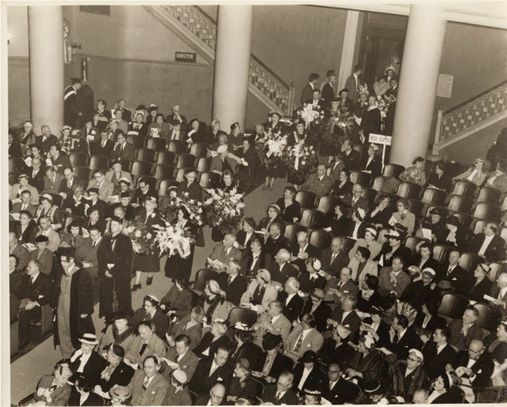
The Daughters of the American Revolution, the City of Rochester, the National Education Association, the National Woman's Party, and the World Woman's Party were among the groups that sponsored wreaths for the unveiling ceremony.

At the New York University Archives, the Records of the Hall of Fame for Great Americans includes general correspondence, administrative files, newspaper clippings, programs, and guidebooks to the hall. Hall of Fame material is also found in the records of the presidents, chancellors, treasurers, and architects of the university from 1900 through the 1970s. The Historic Photographs and Drawings and the University Publication collections contain relevant material as well.