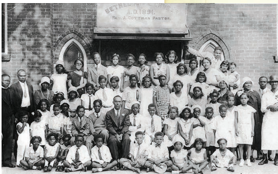
Vine Street AME congregation, date unknown