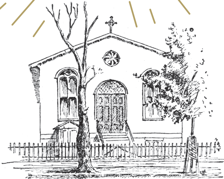
ST. PHILIP'S EPISCOPAL CHURCH.

The history of St. Philip's illustrates the religious diversity of Black churches.