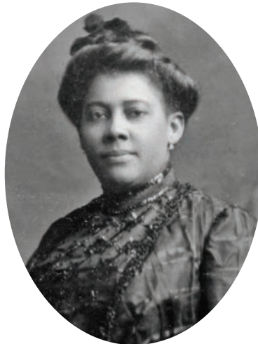
Mary Burnett Talbert

only includes its contributions to Black community life but also the present organization of the Episcopal Church in the US. Its current presiding bishop, Michael Curry, is the son of a former rector of the church. The history of this church illuminates the religious diversity of Black churches in the US and the ways in which various denominations assisted each other in building Black communities, providing a snapshot of how such cooperation may have taken place elsewhere. It is also a story of the determination of Buffalo's Black community to have a viable Protestant church, even if they had to switch denominations to make it happen.