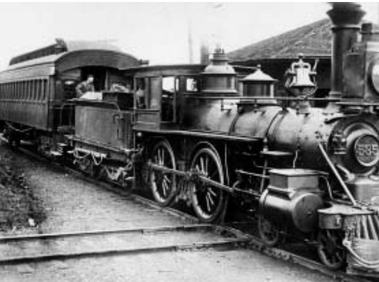
The handwriting on the back of this photograph describes this as the first train to travel over the Erie and Central New York Railroad.

sioners agreed to pay the accrued claims they had been repudiating. The agreement was made in writing, but was never fulfilled.