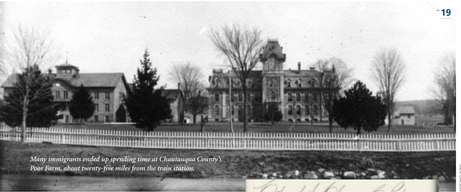
Many immigrants ended up spending time at Chautauqua County's Poor Farm, about twenty-five miles from the train station.