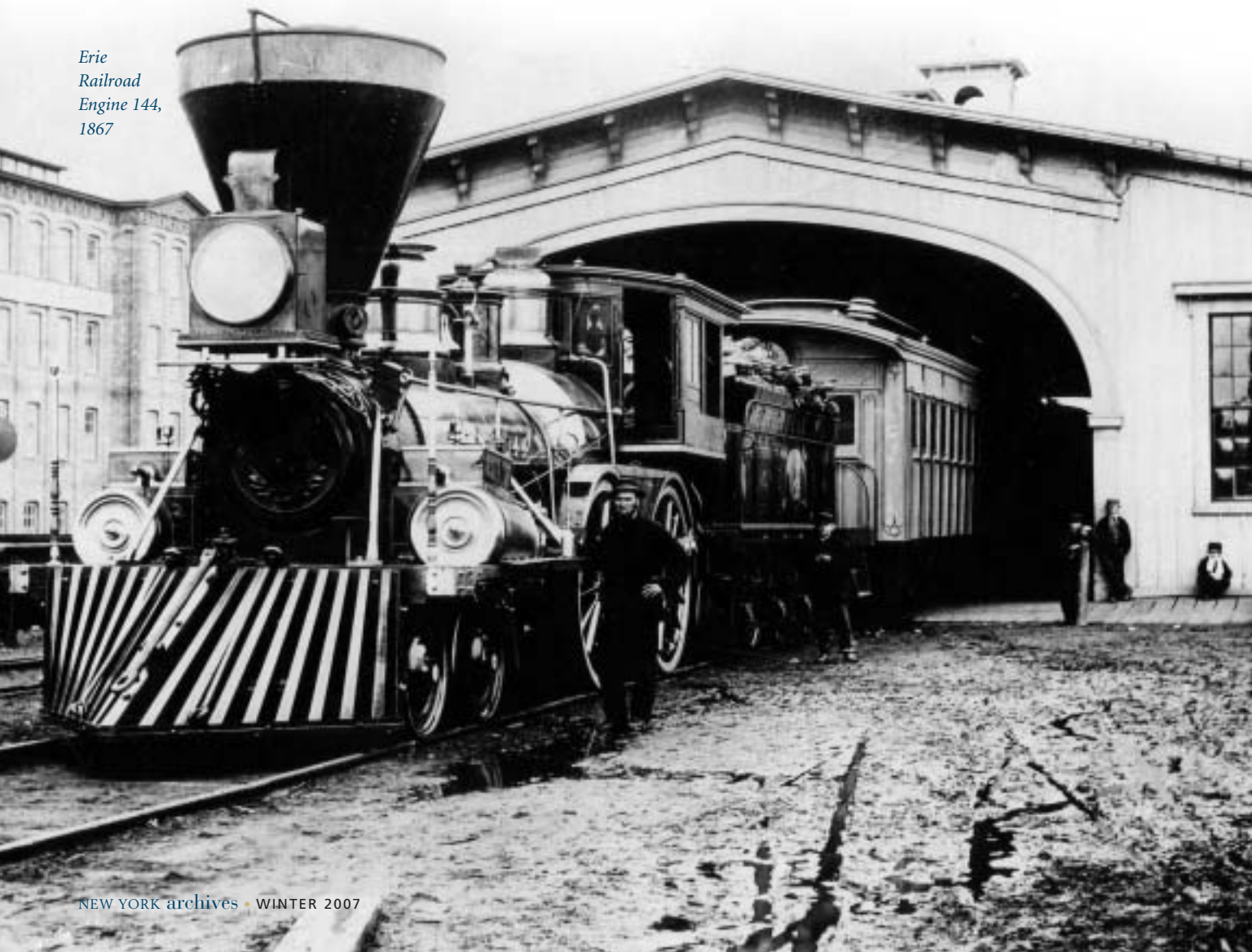
Erie Railroad Engine 144, 1867

Hopes were high in western New York in the mid-nineteenth century when the New York and Erie Railroad came through. But the train brought what none of its backers—or its passengers—bargained on.