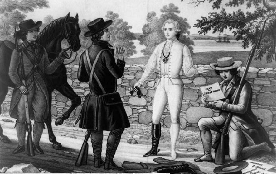
This print shows British Major John André being captured near Tarrytown, New York. The men are examining papers that detailed the fortifications at West Point, which André had hidden in his boot.